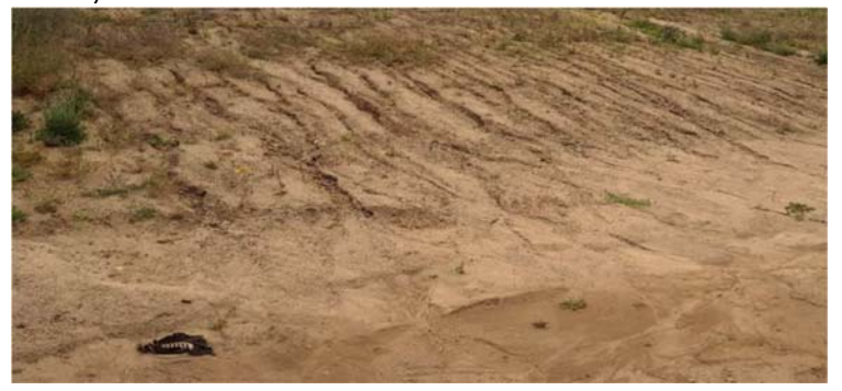
This is not a tourist destination or a candidate for a National Park. Can you quess the cause of this "accelerated erosion"?

An example of this would be the use on plastic sheeting on large stockpiles or on slopes. In this case, the contractor installing the plastic sheeting is hoping to keep falling raindrops from coming into contact with the soil located beneath the plastic. While that may be the case, many times not enough thought is given to what is down gradient of the plastic. Water running off the plastic sheeting at a high velocity will cause significant soil loss when it comes into contact with down gradient erodible surfaces. MD