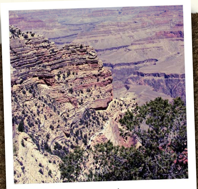
Hixing in the Grand Canyon shortly after sunrise