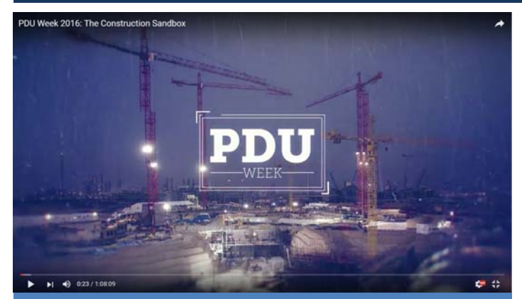
Need Professional Development Hours (PDHs) for your CPESC, CPSWQ, CESSWI, or CISEC?

The 2015/2016 Storm Water Year ends on June 30, 2016. Now is the time to gather all of your analytical results and inspection records. If you have not prepared Ad Hoc Reports yet for the analytical testing, we suggest doing it now. The annual report due date for 2015/2016 is September 1, 2016. But, you do not have to wait until August. We suggest starting on it soon because sometimes SMARTS can slow down near reporting due dates.