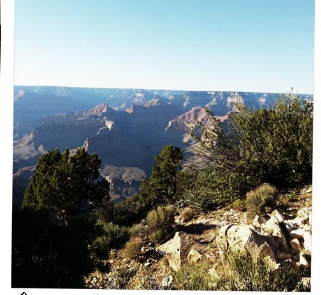
Over a mile of sediment deposits and 1,900 sq miles of incredible erosional features